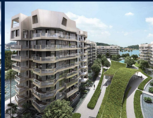
2 - Bedroom