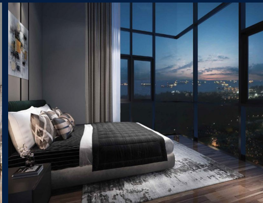
3 - Bedroom