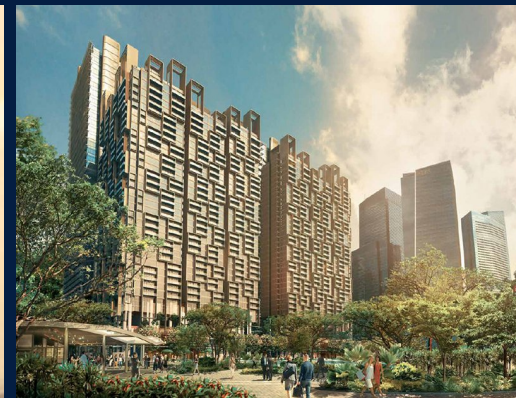
Tower 21 : 3 - Bedroom